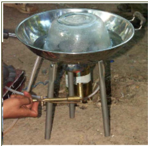
· Close-up of a heating retort