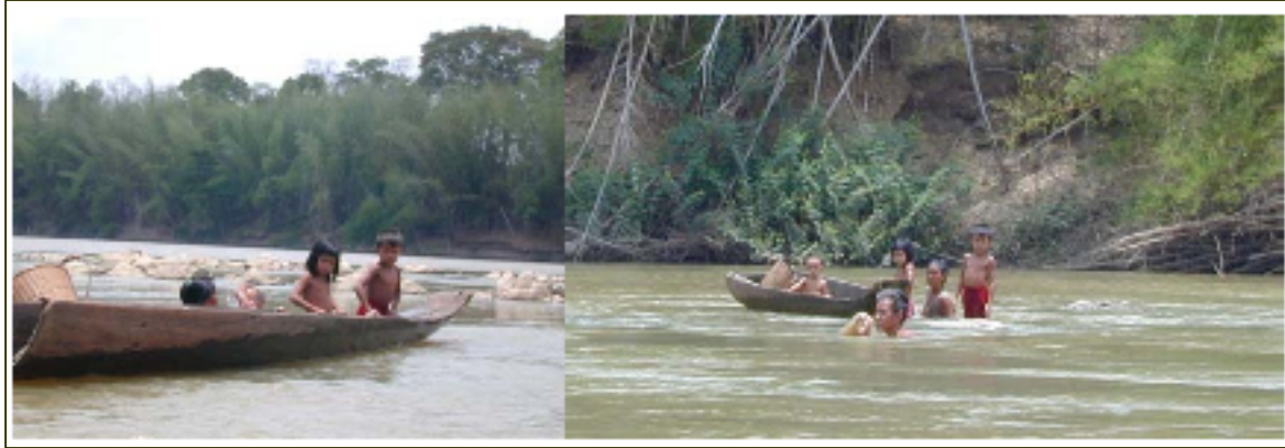
· Villagers swimming in the river near gold mines