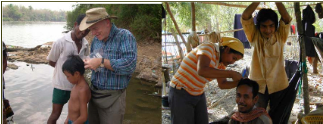
· Collecting hair samples